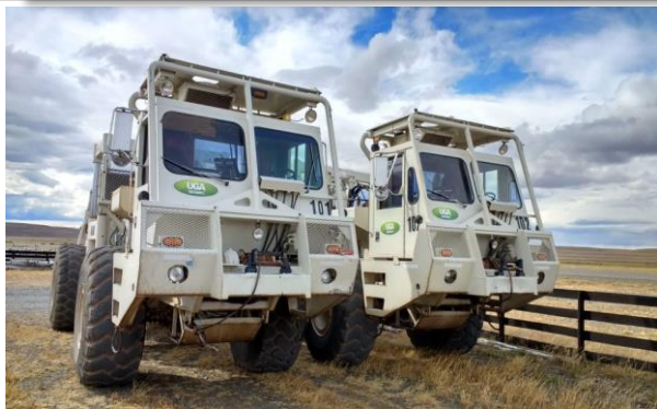
UGA vibroseis trucks in Tapi Aike