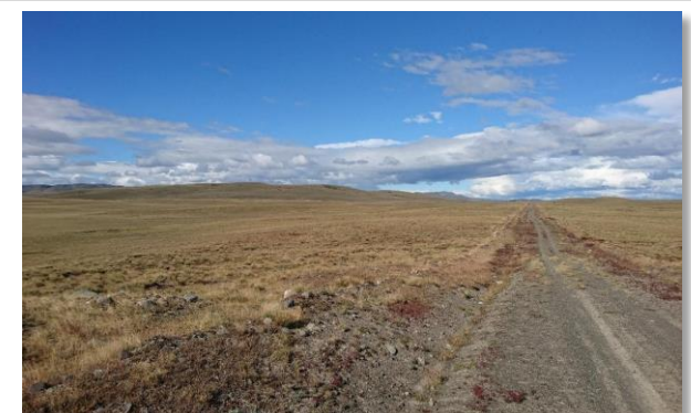
Typical environment in western cube