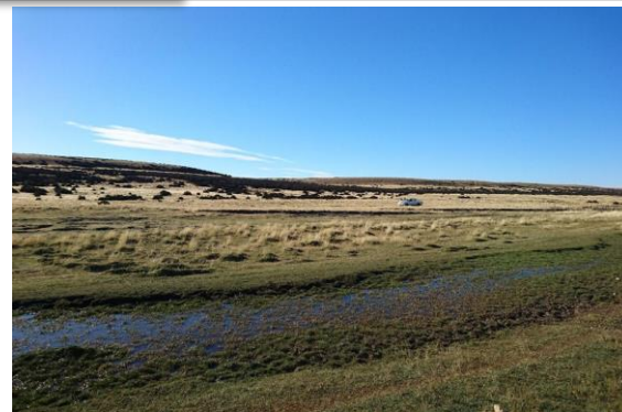
Typical terrain in eastern cube