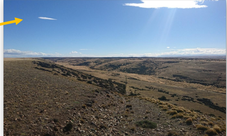
Topography in northern area