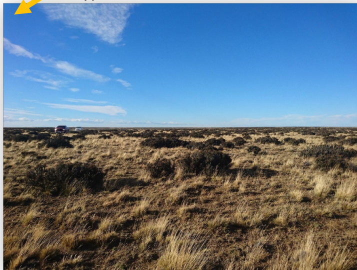
Typical environment in southern area